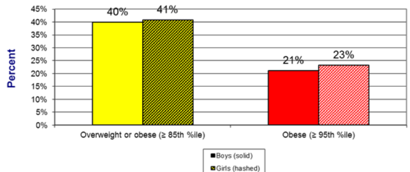
Prevalence of Overweight and Obesity, by Sex

Cherokee Nation Healthy Grant, DCCP , Pigeon Farms, Northeast Ok. Community Action Agency, Inc. , and Northeast Technology Center