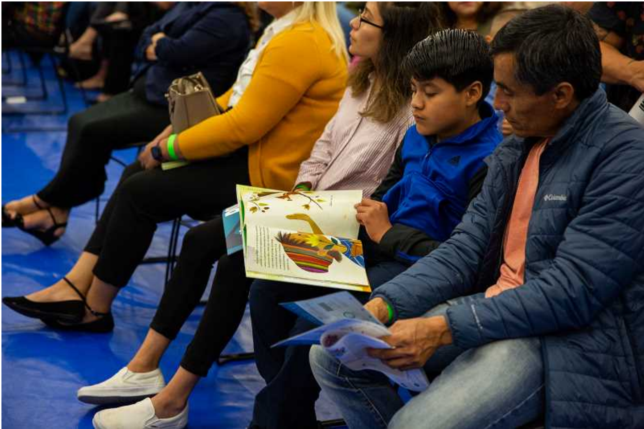
A child flips through the pages of 'Just Ask!' by Sonia Sotomayor during a speaking event with Sotomayor at Portland Community College.

Following an on-stage interview, Sotomayor walked the room, answering a few pre-submitted questions chosen at random.