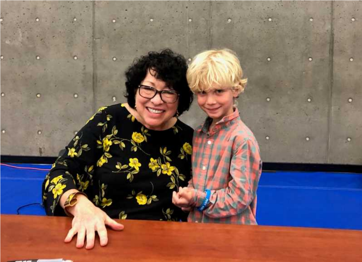
Charlie Hoerster visits with Justice Sonia Sotomayor during a book signing Saturday, Sept. 7.

Supreme Court justice talks about her new children's book, dispenses hugs and opens up about life on the bench at PCC event.