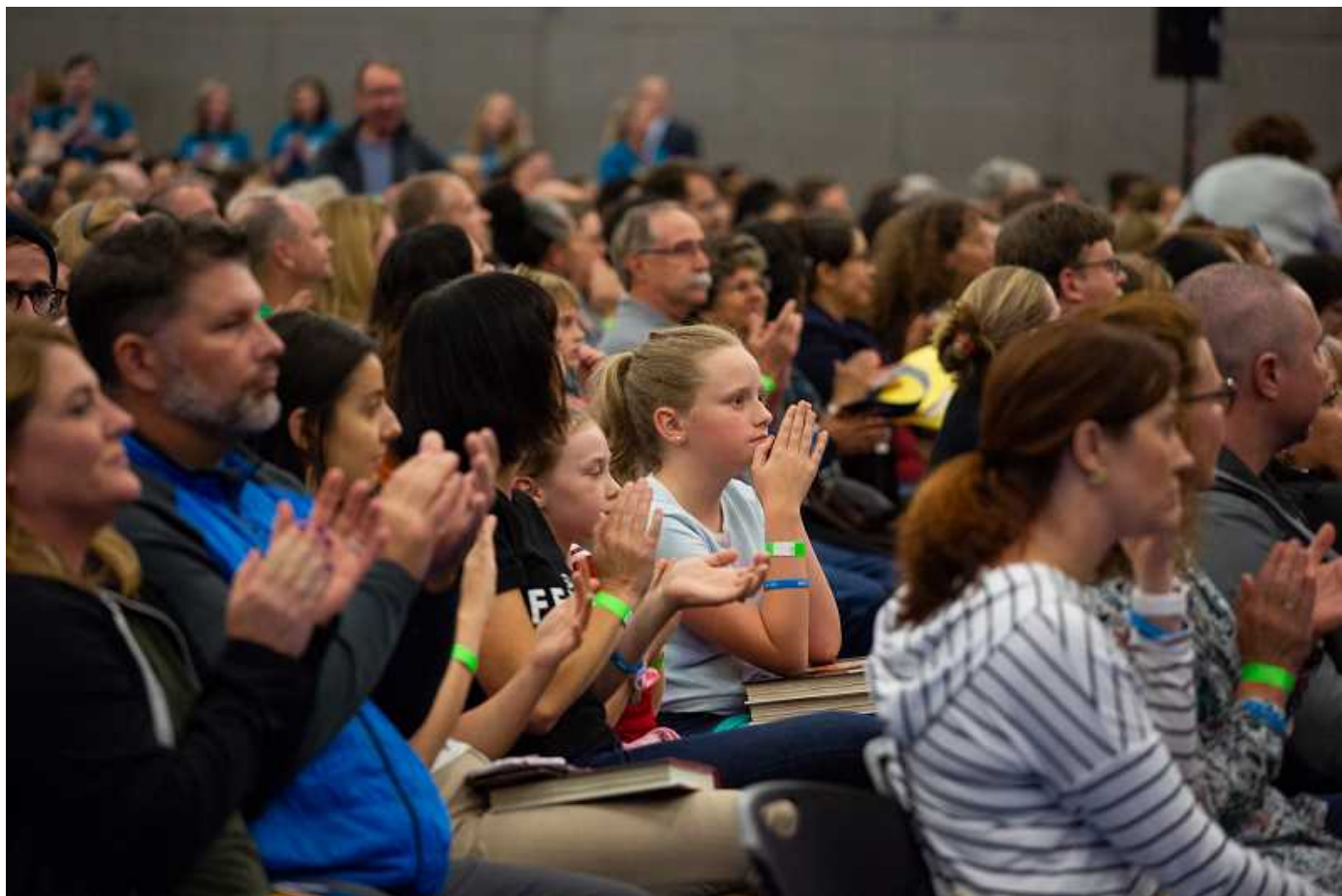
A packed house at Portland Community College applauds for U.S. Supreme Court Justice Sonia Sotomayor. Sotomayor visited Portland to discuss her latest book, which celebrates diversity and strength in children of varying abilities.