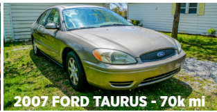
2007 FORD TAURUS - 70k mi