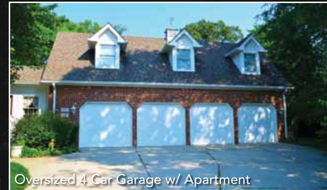
Oversized 4 Car Garage w/ Apartment