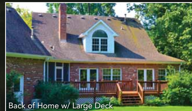
Back of Home w/ Large Deck