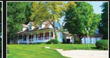
Home & Garage