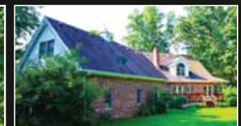
Back of Home