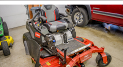
Toro Timecutter - 60" Mower