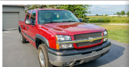
2004 Chevy Silverado - 70k MI