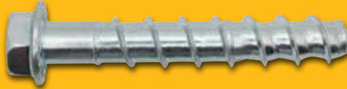
ZINC PLATED SCREW-BOLT+™