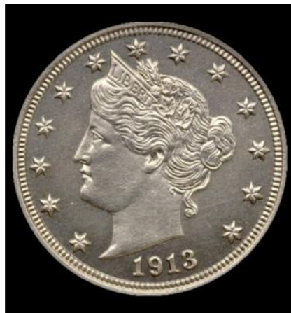
1913 LIBERTY HEAD NICKEL

Surrounded by contemporary farms and a few scattered dwellings, nothing remains of Peyton's Corner