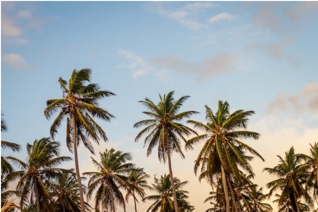
Figure 2. Palm Trees

You can also set the alt text and/or the figure title in an attribute list: