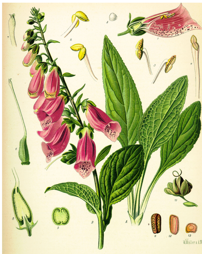
Figure 1.1: The foxglove ( Digitalis purpurea ) contains potent cardiac glycosides, which can easily be fatal for humans. A purified component (digoxin) is used for the treatment of heart conditions. This drawing from “Köhlers Medizinal-Pflanzen”, by Franz Eugen Köhler (1887).

Many organisms have evolved chemicals to kill or repel their enemies. A broad variety of plants produce secondary metabolites to deter grazers. The perennial plant pyrethrum ( Chrysanthemum cinerariaefolium ) produces potent insecticides (pyrethrins) with neurotoxic activity (especially toxic to insects), which at lower doses seem to repel insects. The synthetic pyrethroid insecticides are derived from these naturally-produced chemicals. Many plant species produce tannins: bitter-tasting polyphenolic compounds. Consumption of large amounts of the tannin-rich acorns is known to be problematic for cattle. Water hemlock ( Cicuta sp. ) produces cicutoxin, 3 a highly toxic unsaturated aliphatic alcohol. This compound acts as a stimulant in the central nervous system, resulting in seizures. Livestock is especially at risk, leading to this plant’s common name ‘cowbane’.