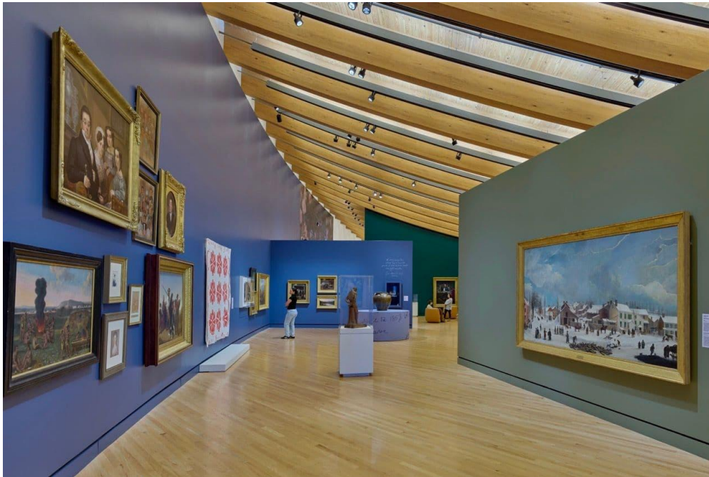
Previous slideNext slide

The Temporary Exhibitions Gallery , which is the sole gallery above the main circulation sequence, linked by a three-and-a-half foot ramp, is a new sort of space. It's 1,300 m 2 and spanned by a 24 m truss containing mechanicals, skylights and other lights, covered in CFRG and acoustical plastic. The Contemporary Gallery across the creek features a sloping ceiling and clerestories on two sides.