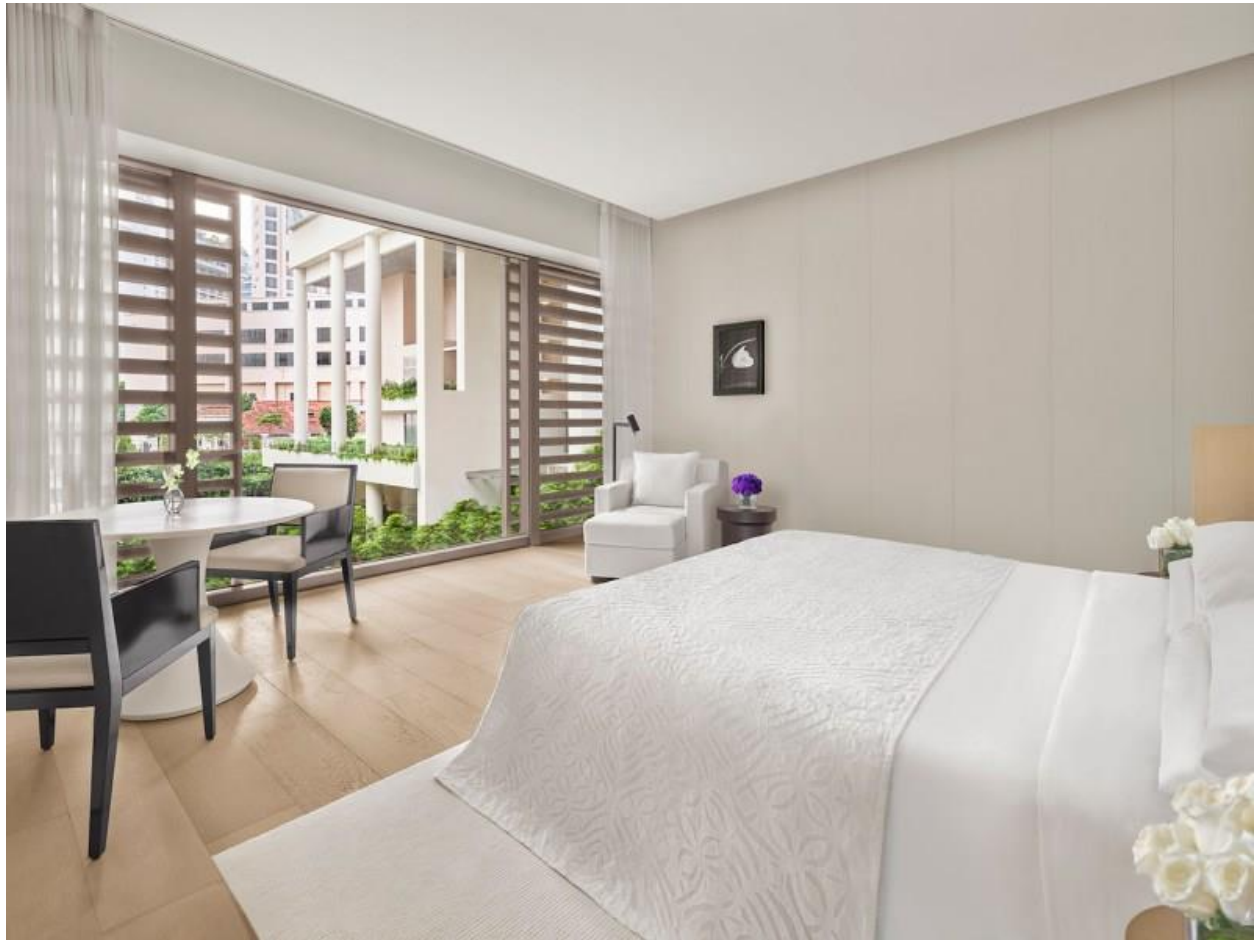
Garden King room

My Garden King room is a study in serene minimalism. The polished cream tones envelop me in a sense of calm, making it the perfect cocoon for unwinding. As I wake in the morning, the blackout curtains draw back to reveal the vibrant greenery of the inner garden. The sight alone feels like a gentle nudge to embrace the day ahead.