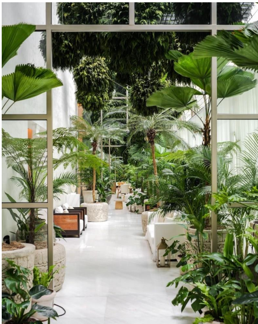
The entrance to FYSH

Stepping into the expansive marble lobby at the Singapore EDITION feels like entering another world. The minimalist design, accented by retro floor lanterns and vibrant greenery spilling from oversized vases, is both understated and inviting. Warm smiles from the staff instantly set the tone for the stay.