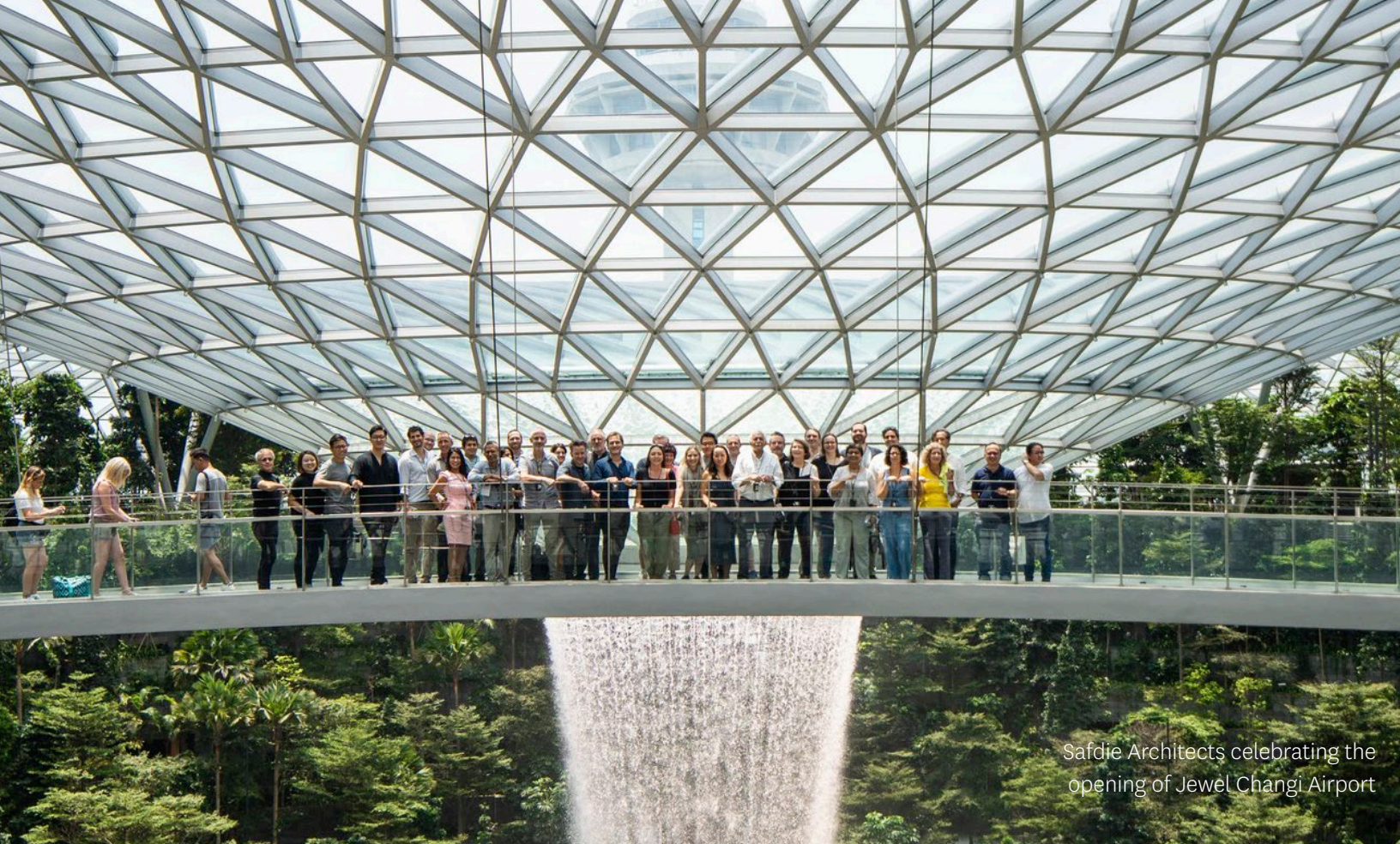
Safdie Architects celebrating the opening of Jewel Changi Airport