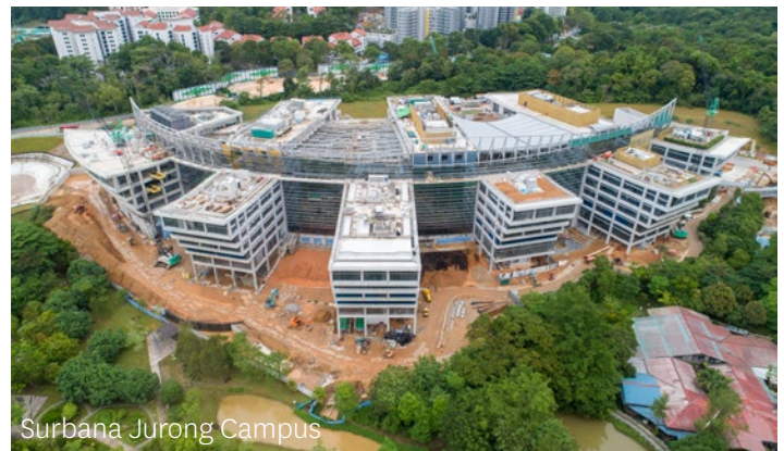
Surbana Jurong Campus