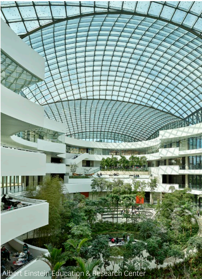
Albert Einstein Education & Research Center