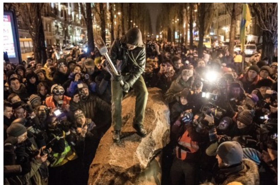
Protesters hammer at the toppled statue of Lenin on Kiev's Bessarabska Square.

Perfectly aware of how unacceptable Ukrainian propaganda was to the masses, Lenin, nevertheless, insisted on creating a 'Ukraine' in order to weaken "the Great Russian oppressor," as he called the Russian Empire's leading ethnic group. It was to protect Ukraine from ultimately dissolving into Russia that Lenin rejected Stalin's plan to turn peripheral areas into autonomous regions within Soviet Russia. Instead, he insisted on creating a Union of Soviet Socialist Republics, which is described in its statutory documents as a rather loose confederation with a right to exit. Current Ukraine dates back to the 'Ukrainian Soviet Socialist Republic' (Ukrainian SSR) that was created within the framework of this Leninist project.