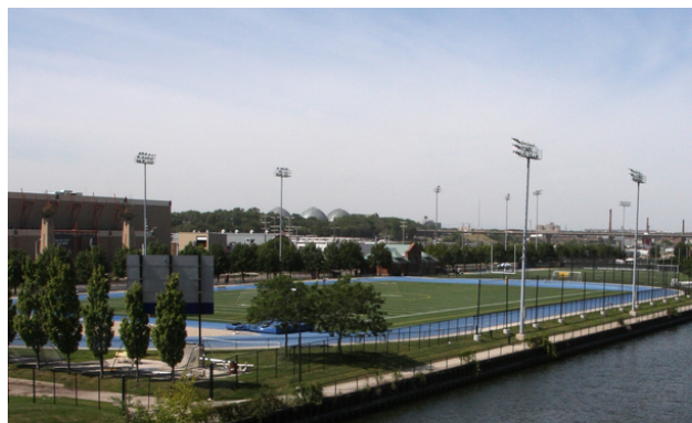
MARQUETTE'S VALLEY FIELDS

THIS COACHING PHILOSOPHY WILL BE APPLIED AT THE CAMP ON AN INDIVIDUAL LEVEL. THE COACHING STAFF WILL BE AIMING TO "MAXIMIZE" EACH CAMPER'S INDIVIDUAL ABILITIES IN ORDER TO BRING THEM TO THE NEXT LEVEL.