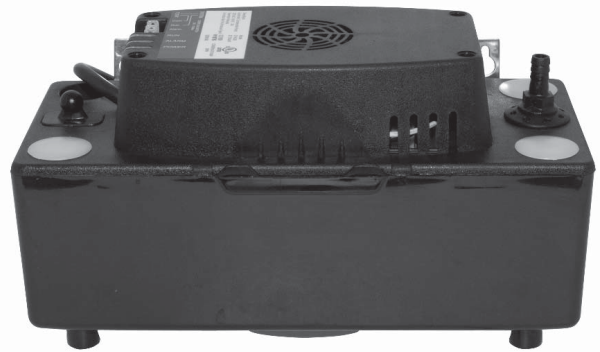
Product may not be exactly as pictured.