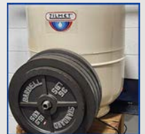
Side connection offers simplicity and strength