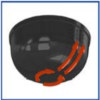
Fresh water flow flushes sediment