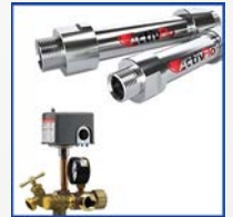
Accessories to create a better system