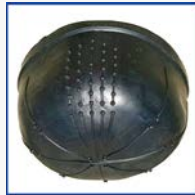
Standoff bumps prevent sticking