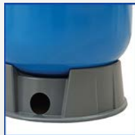
Polymer tank base aligns every time