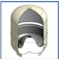
Optimized for capacity & lifespan