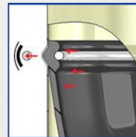
Exterior groove diaphragm seal