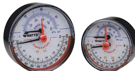
3" (80 mm) Dial LFDPTG3 2½" (65 mm) Dial

*The wetted surface of this product contacted by consumable water contains less than 0.25% of lead by weight.