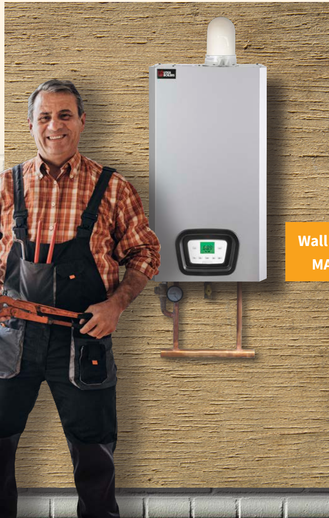
Wall Mounted MAC/MAH