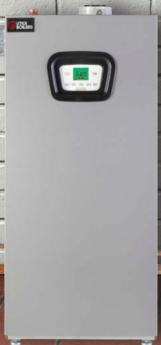
Floor Standing MACF/MAHF