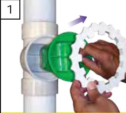
1 Remove Clean-Out Plug