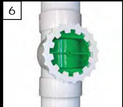
6 Test Complete