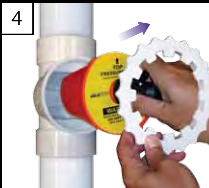
4 Remove Test Wedge