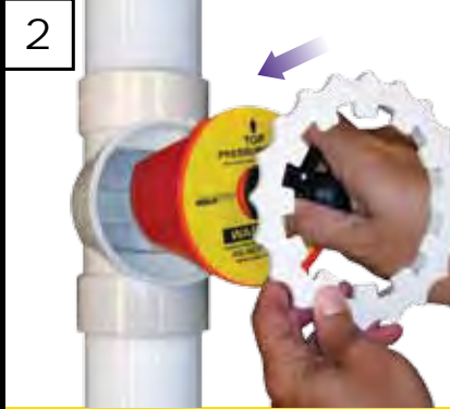
2 Insert Test Wedge