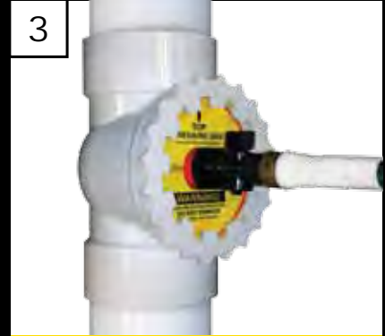
3 Conduct Test