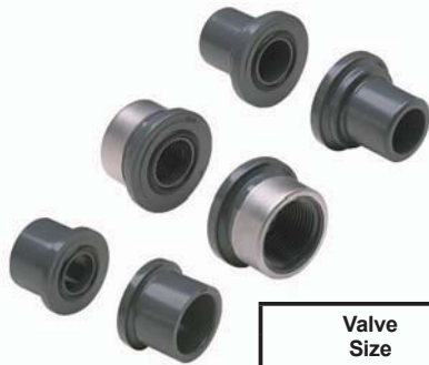
Socket End Connector Set (2)