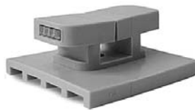
Strut Hangers - Provides Easy Mount to Standard 1-5/8" width Strut Channel