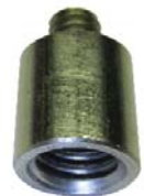
Stainless Steel Flange Nut Mounting Adapter - Adapts CLIC® Flange Nut to 3/8"-16 threaded rod, stud or bolt connection