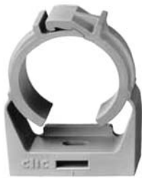
For 1/8" - 2" Pipe & Tubing

CLIC® Economical - Copolymer Construction for Indoor Installation Only