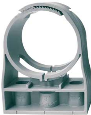
For 2-1/2" - 4" Pipe & Tubing