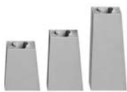
Stand-Off Spacers - Approximate distance from mounting surface to surface of pipe