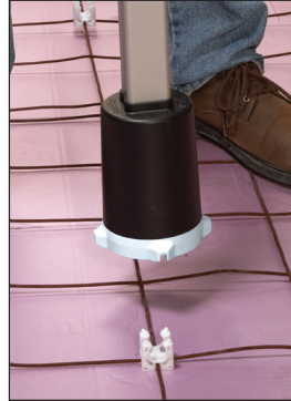
SmartClip is design for a secure 4 point wire connection