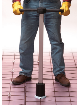
Use the SmartTool standing comfortably