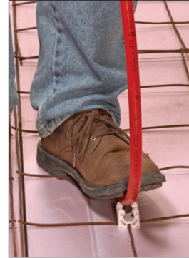
Protective plastic-to-plastic PEX connections