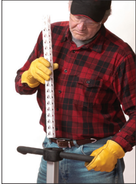
Easy top-loading SmartClip magazine

For fast, uniform layout of PEX to a wire grid with foamboard base