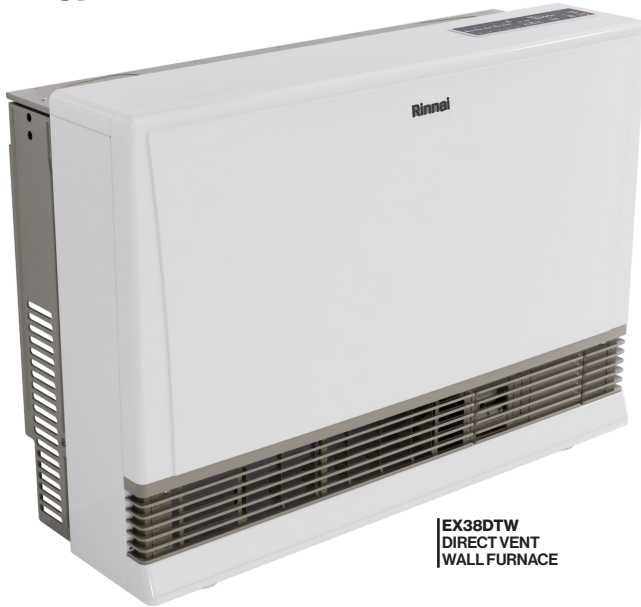
EX38DTW DIRECT VENT WALL FURNACE