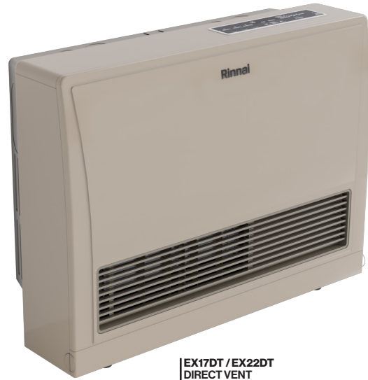
EX17DT / EX22DT DIRECT VENT WALL FURNACE