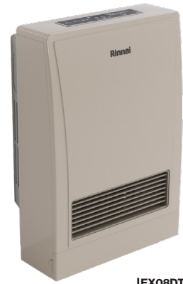
EX08DT / EX11DT DIRECT VENT WALL FURNACE

Modulating gas valve and variable-speed blower provide consistent warmth and comfort