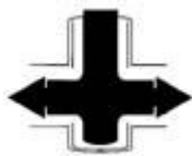
Normal operating flow position

Lift stem and rotate top of valve so top arrow points in direction of clog, either upstream or downstream