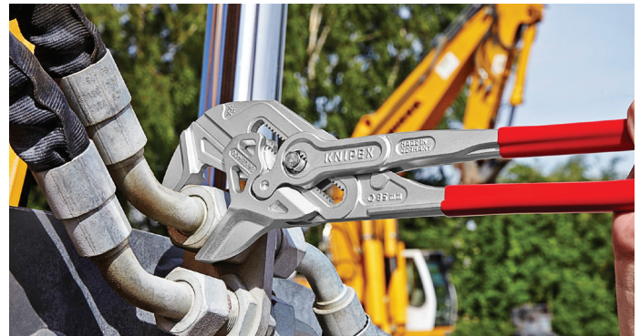
16" Pliers Wrench for large applications up to 3 3/8"