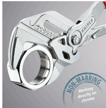
Smooth jaws can be applied directly to chrome surfaces