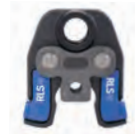
RJ Series Jaw