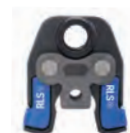
RJ Series Jaw