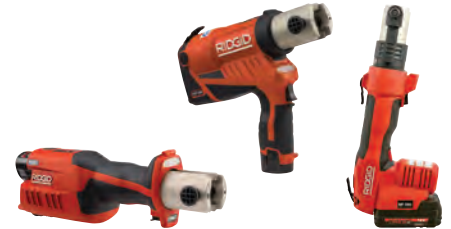
RIDGID Compact Press Tools* RP 240, RP 241, RP 200, RP 210, RP 100