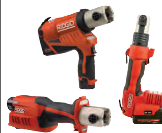
RIDGID Compact Press Tools* RP 240, RP 241, RP 200, RP 210, RP 100