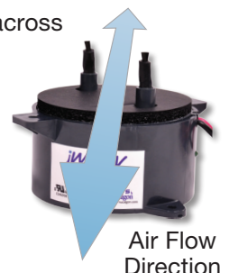
Air Flow Direction