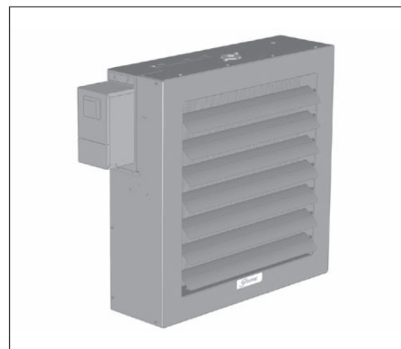
Figure 2.1 Field Installed Transformer Accessory