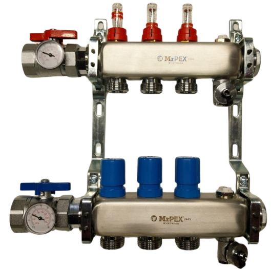
*Shipped as shown

The RETURN (lower) manifold, has manual on/off valves that controls the flow for each individual circuit. The manual knob can be removed to accommodate the MrPEX actuators (part# 5120700 & 5120701) using VA10 Adapter. Supply and return mains can be connected from either left or right sides. The manifold comes ready for a left-hand connection. Connection from the right can be done by removing the manifold body from the brackets and flipping them over. Supply/Return valves are 1 1/4" NPT