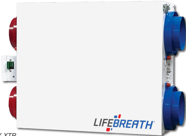
MAX XTR 184 CFM @ 0.3 (75) IN. W.G. (PA)