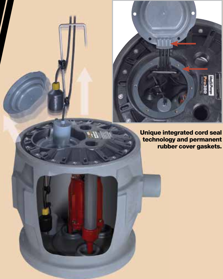
Unique integrated cord seal technology and permanent rubber cover gaskets.