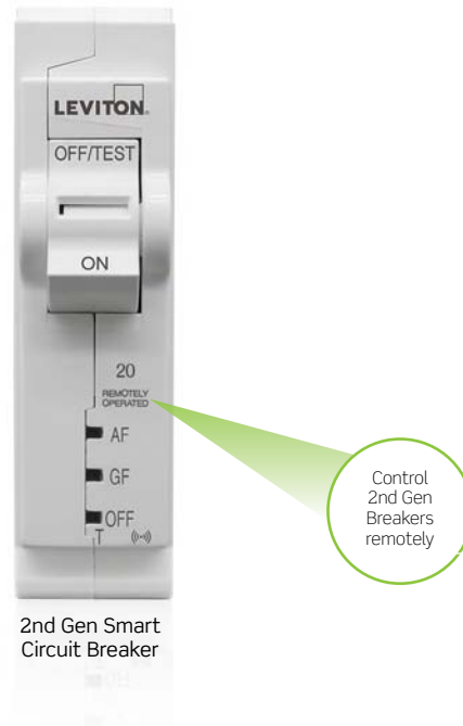
2nd Gen Smart Circuit Breaker