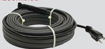
120 Volt - Grounded Plug