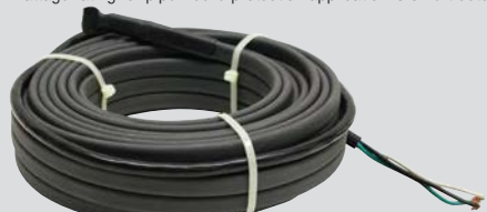
240 Volt - Cold Leads

*Wattage rating for pipe freeze protection application is 6 w/ft determined at 40°F (5°C).