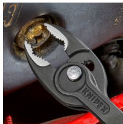
82 01 200 The original 8" TwinGrip will grip objects from 5/32" – 7/8"