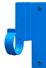
1-1/4", 1-1/2", 2"