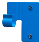
1/2", 3/4", 1"