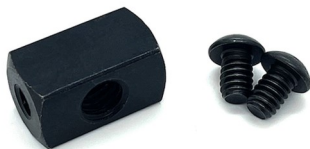
PL-1111-BTR1 OR PL-1111-BTR4