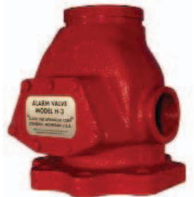
MODEL H-3 FLANGE/GROOVE