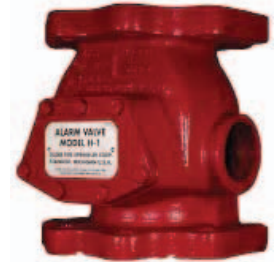
MODEL H-1 FLANGE/FLANGE