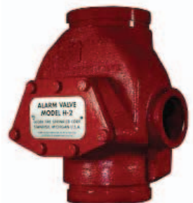
MODEL H-2 GROOVE/GROOVE