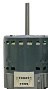
Genteq ECM model 3.0 motor