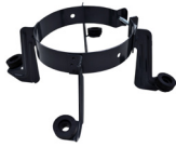
Stock # 5K002 48 Frame OEM mount