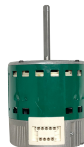
Genteq Evergreen VS motor