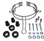
Stock # 5K003 / 5K004 48 Frame 10" / 11"