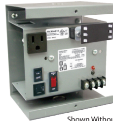
Shown Without Cover