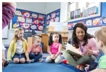
Day Care Facilities