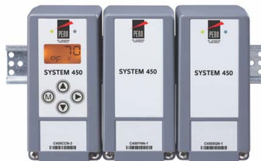
System 450 Control System with a Control, Power, and Expansion Module