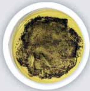
BLACK COLONIES OF BACTERIA

SurfaceShield's advanced LED technology, powered by Vital Vio, helps keep your bathroom cleaner and healthier for your family.