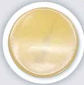
NO VISIBLE COLONIES

Lab experiment showing bacterial growth over four days under normal lighting compared to SurfaceShield™ lighting