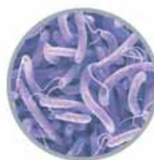
GRAM NEGATIVE BACTERIA