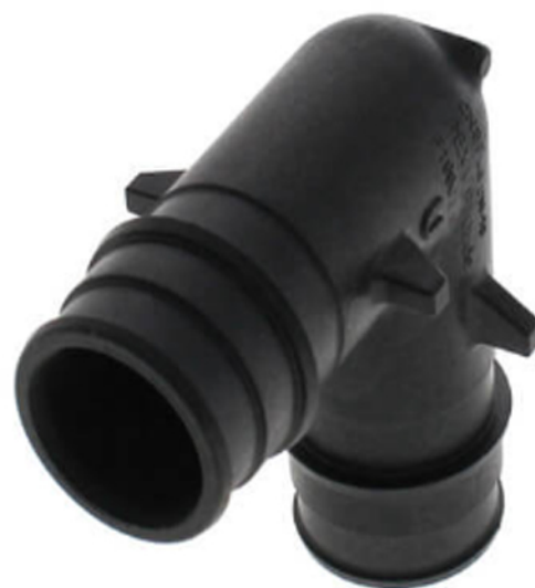
Insert for Fittings Size (Inch)