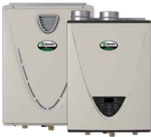
240 OUTDOOR MODEL 240 INDOOR MODEL