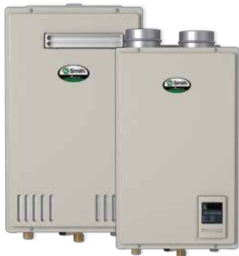
140 OUTDOOR MODEL 140 INDOOR MODEL