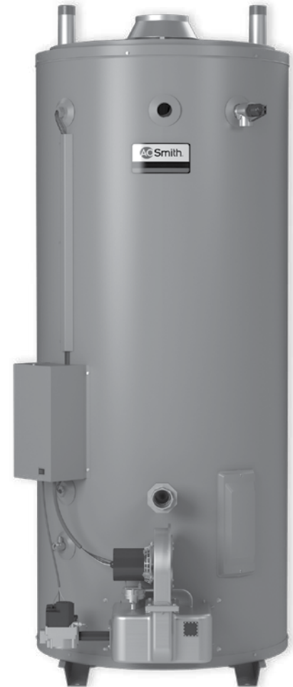
MODELS BTL-120 THRU BTL-400(A) SERIES 200