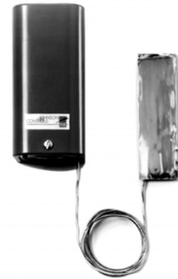
A19CAC-1 (Remote Bulb Model)