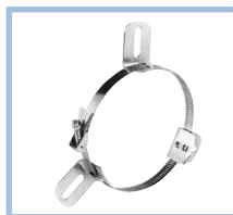
A252 Single Strap, Single Slot 2" L x 3/8" W $17