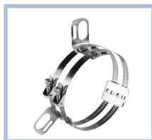
A250 Double Strap, Dual Slot 2" L, 1/4" & 3/4" W $17