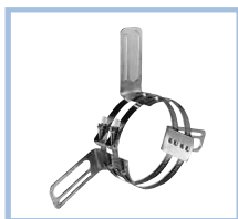
MA251 ■ Double Strap, Dual Slot 4" L, 1/4" & 3/4" W $17