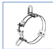
A254 Double Wire, Single Slot 2" L x 3/8" W $17

■ Please note MARS has added an "M" to the front of this item.