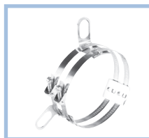
A253 Double Strap, Single Slot 2" L x 3/8" W $17