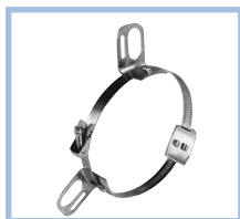
A249 Single Strap, Dual Slot 2" L, 1/4" & 3/4" W $17