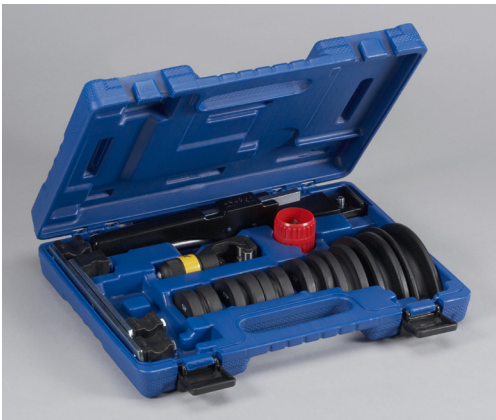
60331 Basic Kit