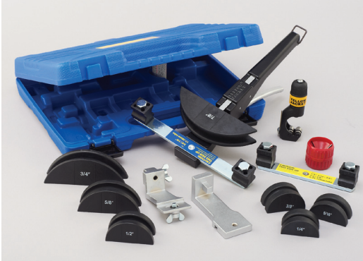
60325 Deluxe Kit