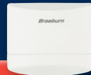
5390 Indoor Remote Sensor

Contractors! Buy a touchscreen hybrid thermostat and get a FREE Braeburn thermostat guard or remote sensor Visit www.braeburnonline.com/freeoffers for details.