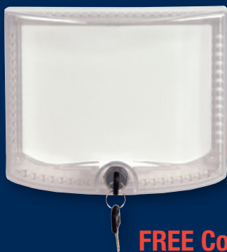
5970 Thermostat Guard

Contractors! Buy a touchscreen hybrid thermostat and get a FREE Braeburn thermostat guard or remote sensor Visit www.braeburnonline.com/freeoffers for details.