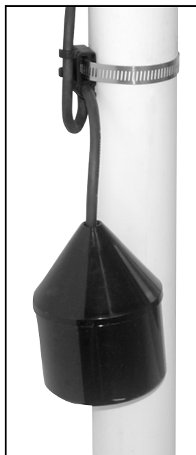
Pipe Clamp Type