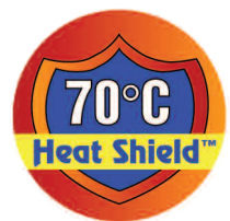
* Heat Shield